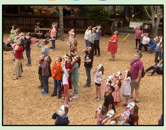
We are CREW, not passengers!